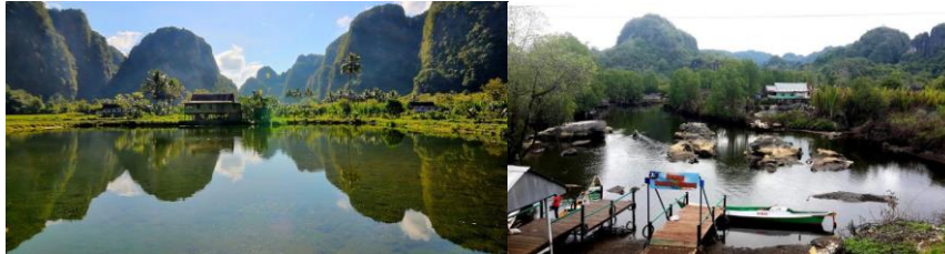
Figure 1 Rammang-Rammang Karst Tourism

are interesting and have not received a touch of representative governance for tourists (Golob, 2019; Parmawati et al. , 2018). Beautiful view but not professionally managed.